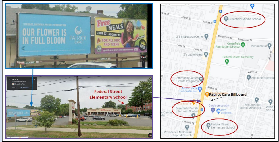
Location of a billboard in Greenfield, MA where Patriot Care (a local cannabis dispensary) has posted several recent advertisements.